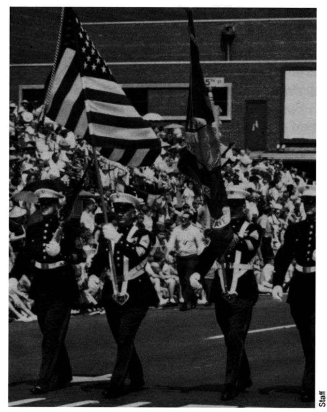
A Memorial Day parade.

The Passover is the first of God's seven annual festivals which outline His master plan. The peoples of the world have rejected and forgotten God's festivals. If we, like the world, reject these days we will also forget His plan we will forget the knowledge of the purpose of