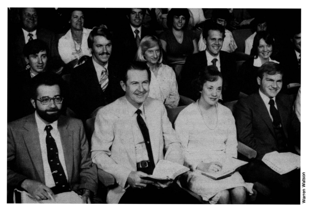
Members of God's Church being taught at Sabbath services.